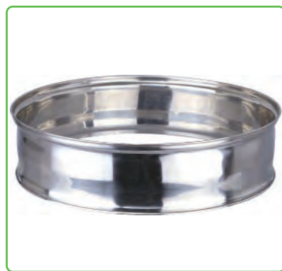
Extender Ring Attachment